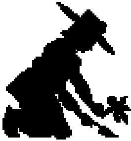
Tending the garden . . .